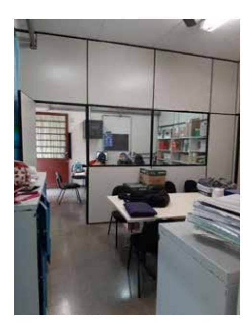
Figura 6 - Management spaces were not planned and needed to be improvised, while removed.

Teachers' management and workspaces outside the classroom lack an adequate structure that guarantees the minimum conditions for carrying out the planned activities In the case of the Early Childhood Education Centre (CEI), management spaces were not planned and needed to be improvised, while areas that could be destined for children were removed (figure 6). At EMEI and EMEF, although there is a generosity of physical space, places such as a canteen, class preparation room, meeting room, and similar areas are uncomfortable and do not offer privacy, making their occupation unattractive (figure 7).