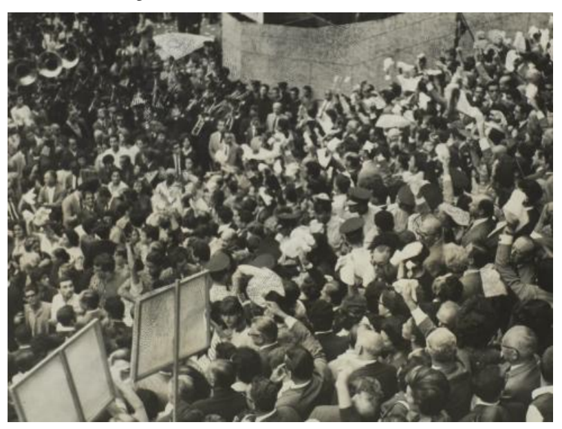
Figure 2 - Manifestations at the Family March with God for Freedom on March 19, 1964, in Praça daSéPaulo https://pt.wikipedia.org/wiki/Marcha_da_Fam%C3%ADlia_com_Deus_pela_Liberdade

Brazilian society has always incorporated conservative movements into its dynamic, so it was in 1964 when the eve of a military movement known as the March 1964 coup, demonstrations were, collaboratively held in the cities of São Paulo and Rio de Janeiro in defense of "Freedom and the Family", and its resurgence made the relationship between researchers and municipal managers responsible for approving the research quite delicate (see figure 2).