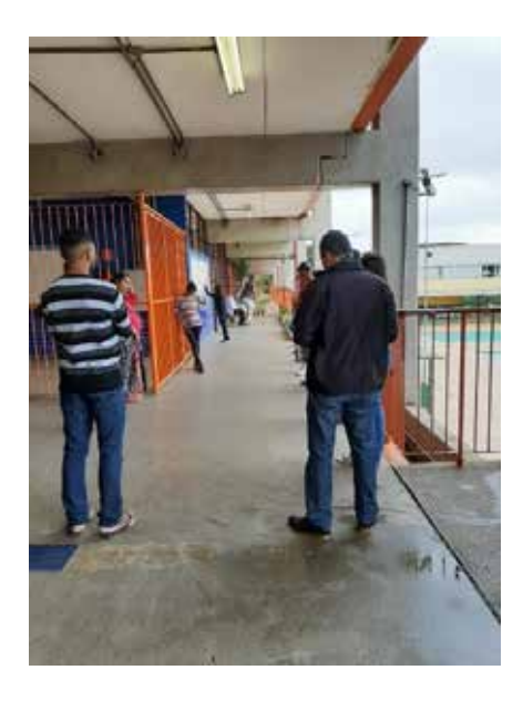
Figure 4 - Grids give a sense of imprisonment and control.

As we walk through CEU Butanta, the feeling of imprisonment and control pervades the environment, disturbs the gaze, and it is very difficult not to feel a sense of permanent insecurity, as paradoxical as this statement may seem, the bars generate a feeling that some violence is about to happen (figure 4). This is not a condemnation of the mere existence of bars or minimization of the situations that led to their existence. It is important to point out that the implementation of any project contemplates unanticipated questions which only time will enlighten, and that, therefore, these questions should be dealt with in greater depth by avoiding simplistic solutions.