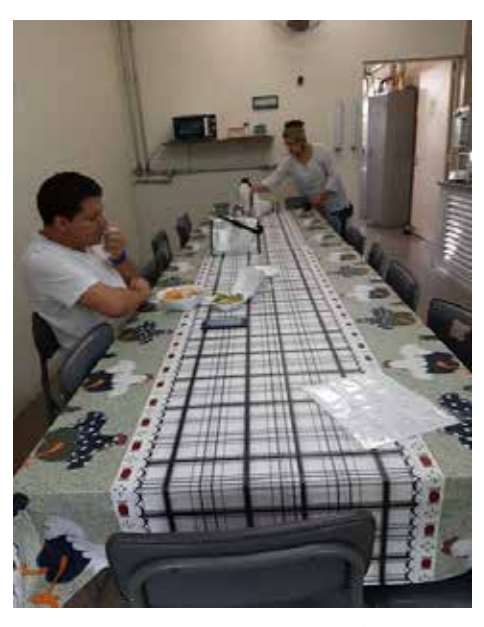
Figure 7 - At EMEI and EMEF, although physical space is generous, places such as a cafeteria are uncomfortable and do not offer privacy, making their occupation uninviting.