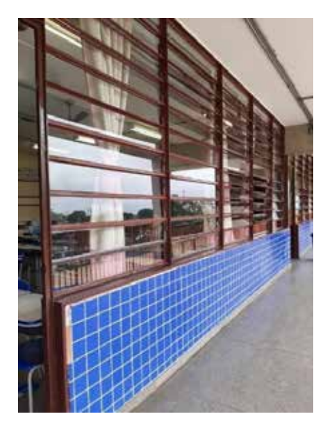
Figura 5 - Large number of windows in the classrooms providing splendid natural lighting, but significantly affecting the privacy and concentration of students.

Continuing our observations it seemed significant to us a large number of windows in the classrooms providing splendid natural lighting, but significantly affecting the privacy and concentration of students at various times, due to the excessive noise coming from the corridors and outside spaces, the same being observed about the intensive use of the pool (figure 5)