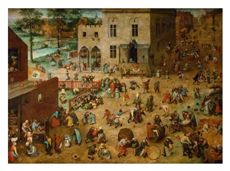
Figure 10- For the children, the research on play took place during visits to the library, we suggested and analyzed the table "Children's games" (1560) by Pietr Brueghel, the old man. < https://en.wikipedia.org/wiki/File:Pieter_Bruegel_the_Elder_-_Children%E2%80%99s_Games_-_Google_Art_Project.jpg>. Consulted in November 2020.

For the children, the research on play took place during visits to the library, we suggested and analyzed the painting "Children's games" (1560) by Pietr Brueghel, the old man (figure 10). Describing a game on the board, where one child throws a feather up for the others to catch, we asked why the feather and one of them explained how the feather comes down by gliding and takes longer, unlike the falling stone, giving no time to jump. Look at the physics being checked, in practice! At school, the games were reproduced according to age group. And during the visits, we told about Brueghel's life, his origins, and the historical period of the painting. On the same occasion, we presented the works of various artists from that time and at those moments, the children spontaneously recognized other paintings by Brueghel. The library presented art books, maps, music, a webpage that made it possible to zoom in on the games on the painting "Children's games" with the appropriate rules. The children "interviewed" their families inquiring about their childhood play. All this research contributes to the informational literacy proposed as a project for the use of the library and its resources.