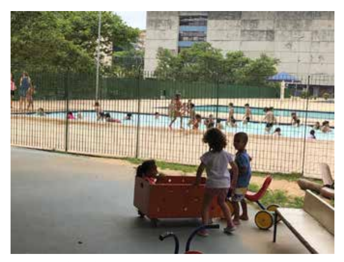
Figure 9- Photo by Ingrid Hötte Ambrogi

The library's occupancy experience plays a fundamental role in extraordinary activities. The activities promoted by the librarians in agreement with the teachers, the coordinators, are of great importance because they represent a break in the daily life of the students and we present here an experience that we consider a small manifesto on the production of knowledge in the daily life of the CEU.