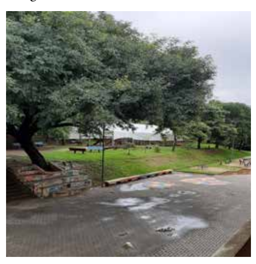
Figure 8 - It would be very interesting to guarantee the appropriation of the external space allowing the break, recreation, to occur outside the building.

It generates a nuisance that the class interval, known as recreation, takes place in an open space partially on the intermediate floor of the education building, which is quite busy, in a spatial configuration that refers to imprisonment, confinement, it would be very interesting to ensure the appropriation of external space allowing the interval, recreation, to occur outside the building (figure 8).