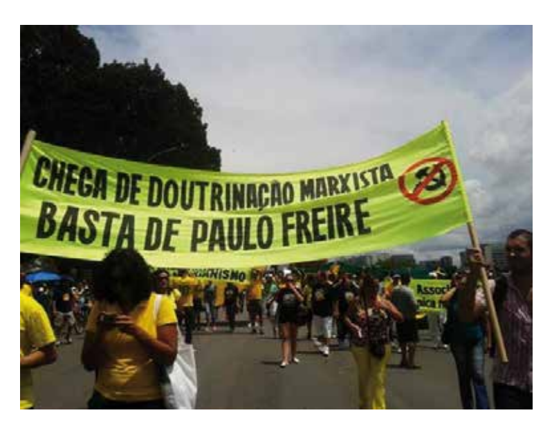
Figure 1- In a pro-impeachment demonstration by President Dilma Roussef in 2016, Paulo Freire is accused of "indoctrination"