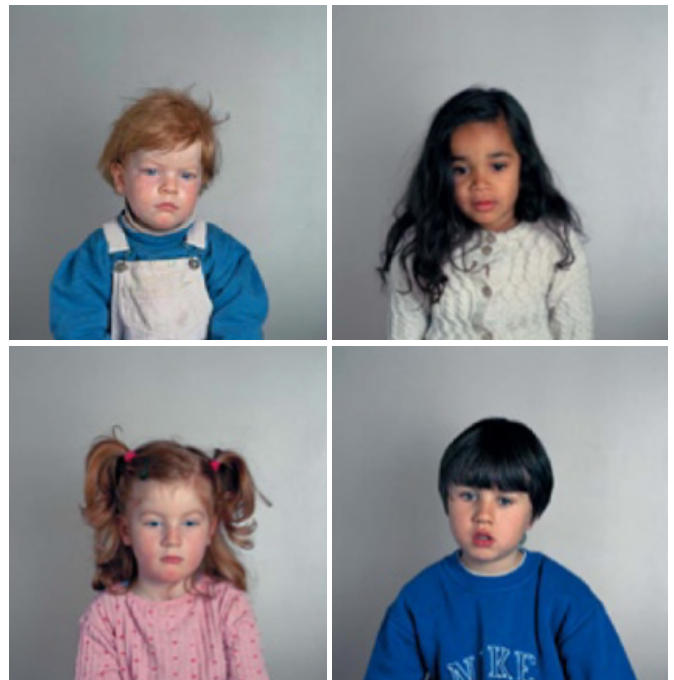
Fig. 3. "Disenchanted" („Entzaubert“, Hahn & Klemm, 2007)

Beyond these theoretical deliberations, the mentioned relation between vital and mental activity in children could be of practical relevance for education. For this purpose, a thorough phenomenological observation of children in different situations of daily life is required. Exemplarily, we are going to scrutinize some images of children here (see fig. 3): All children depicted appear inactive or calm in a certain way but not in the sense of being one with themselves, but rather of being distracted from themselves, sedated or paralyzed by something. Their posture is a bit sunken and their facial expression varies between gravity, bewilderment and a certain kind of sadness. In total, these phenomena can be expressed as a state of bodily and emotional inactivation or devitalization. So, how can this be explained? What we do not see immediately is that these children were photographed while watching television.